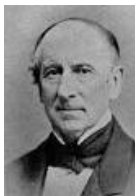
Augustin Louis Cauchy