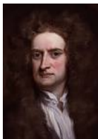
Sir Isaac Newton