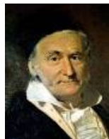
Carl Friedrich Gauss