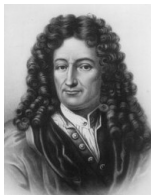
Gottfried Wilhelm Leibniz

In the same year 1683, a famous German mathematician, Gottfried Wilhelm Leibniz (1646-1716) independently discovered the same idea of determinant in Europe. He wrote to de L'Hospital (1661-1740) explaining his idea in solving a system of linear equations.